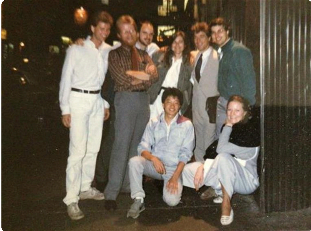
New York City 1982